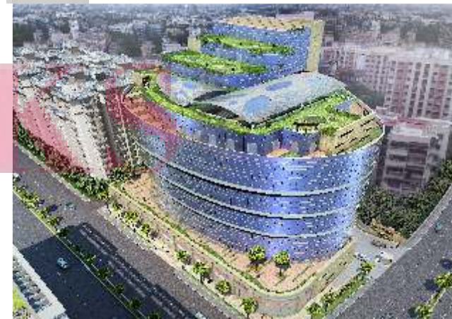
Hubtown Solaris, Andheri (E)