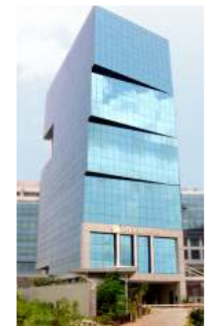
Ackruti Gold, BKC