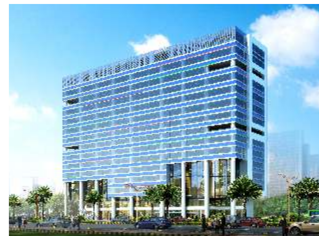
Hubtown Viva, Andheri (E)