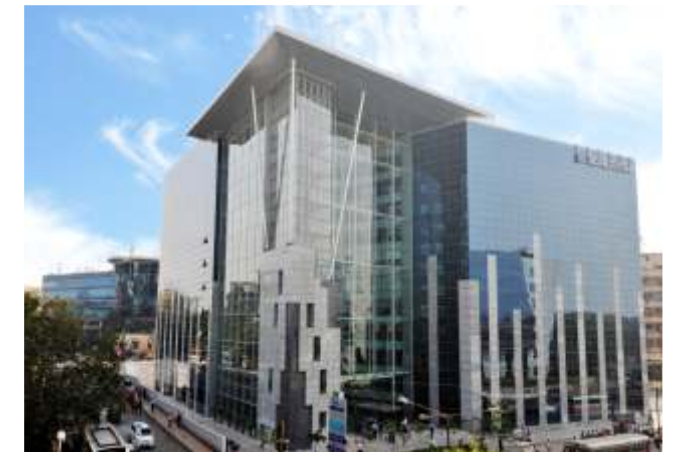
Ackruti Star, Andheri (E)