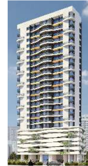
Hubtown Siddhi, Thane (W)