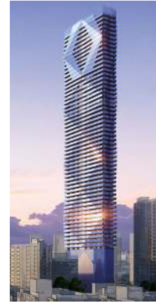
Hubtown Realms, Hughes Road