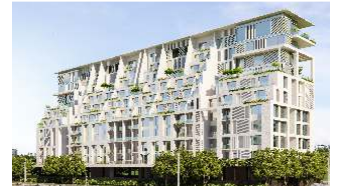
Hubtown Harmony, Matunga (E)