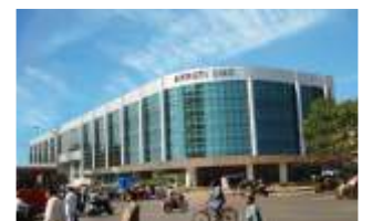
Ackruti SMC, Thane (W)