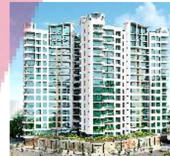
Hubtown Serene, Bandra (E)