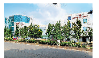
Ackruti Corporate Park, Kanjurmarg (E)