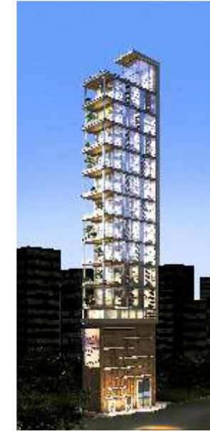
Hubtown Monte Metro, Peddar Road