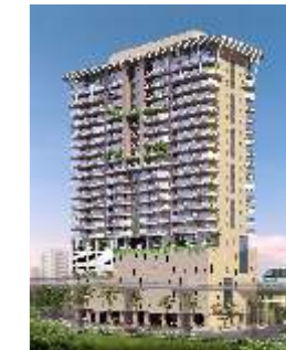
Hubtown Vedant, Sion (E)