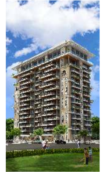
Hubtown Sunstone, Bandra (E)